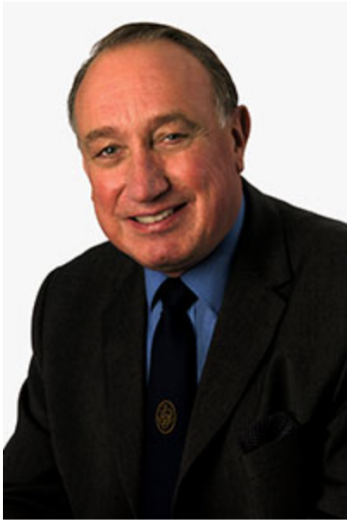
FREng FASHRAE, Presidential Member ASHRAE